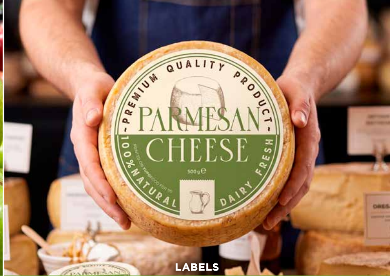
YUPOFOOD FDR 110