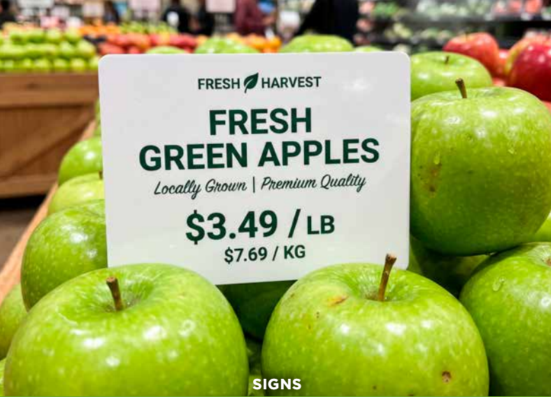
YUPOFOOD FDR 250